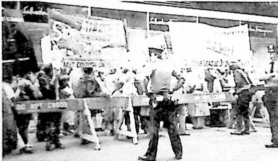
Trump Tower in Manhattan was spontaneously closed down at a housing demonstration on May 4, attended by nearly 1,000 people. The protesters called for an end to tax abatements for luxury apartments and office buildings at the expense of funding low-income housing. The action was sponsored by over 30 tenant, homeless and religious groups and Mobilization for Survival/New York.

In addition, the issue of U.S. aid to the "contra" rebels trying to overthrow the Sandinista government is by no means dead, and it is quite possible that some measure will come up after the Congress' Memorial Day recess. Call the MfS/NY office to find out how you can plug into efforts opposed to "contra" aid.