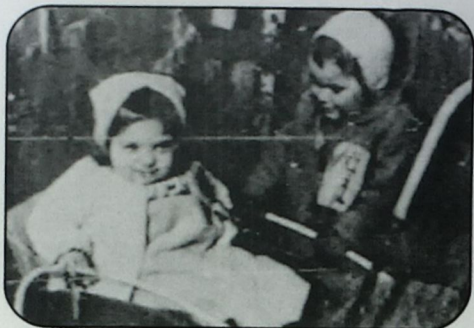
Pictured above: Jewish children being sent to Jasenovac