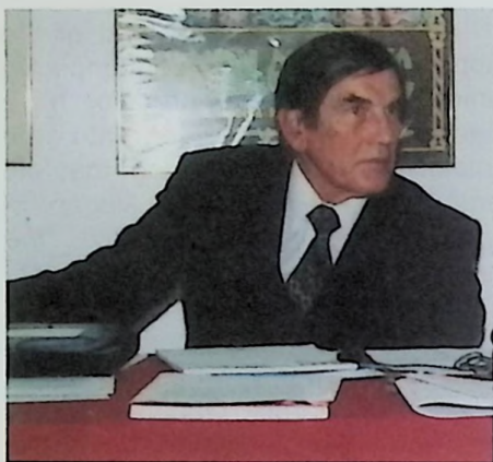
By Vladimir Chechentsev