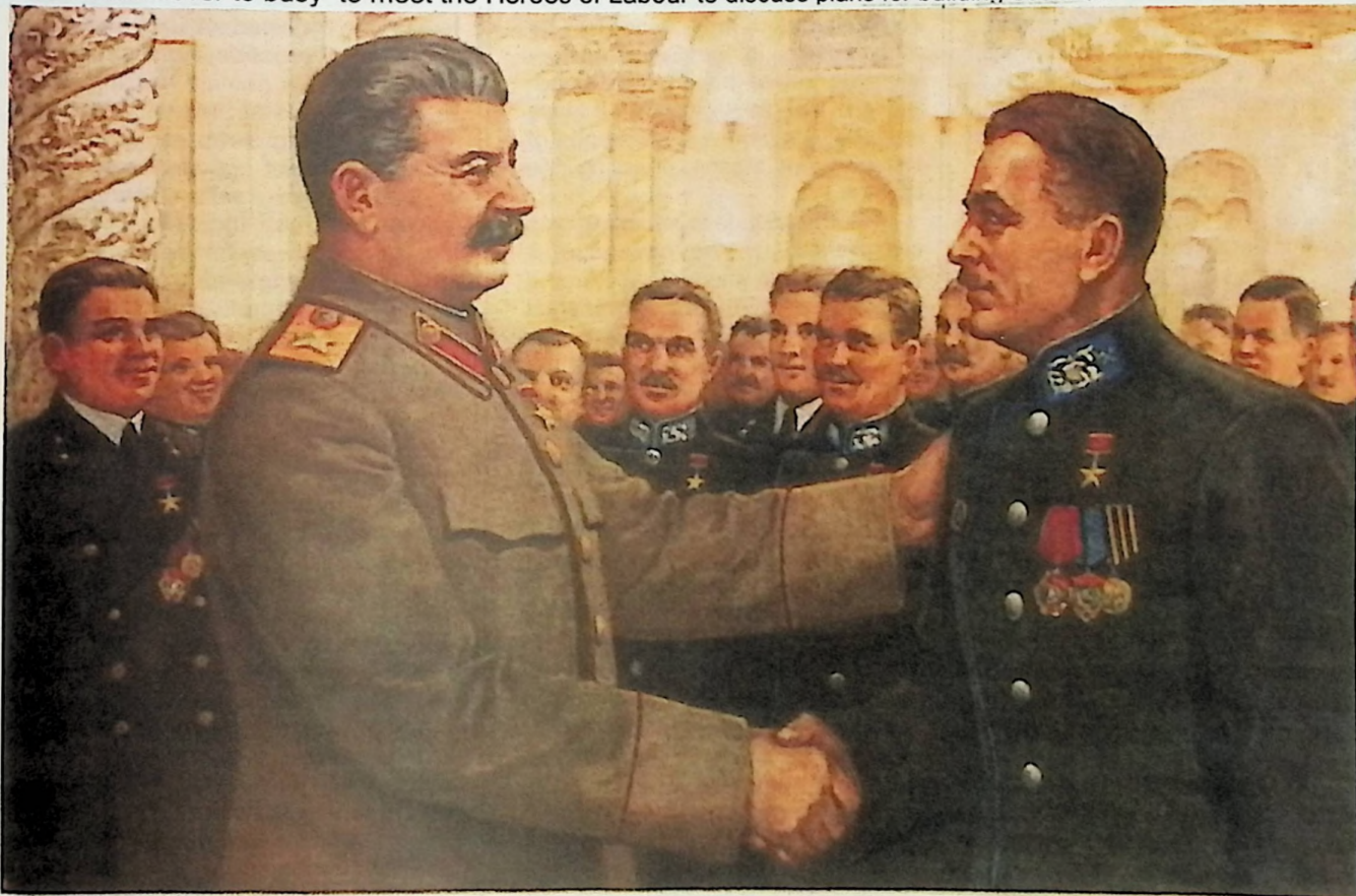
Stalin was never too busy to meet the Heroes of Labour to discuss plans for building Socialism

Betrayal is a widespread phenomenon, both in people's personal life, and in historical processes. It is a permanent factor of human existence. The history of humanity is contradictory. It has