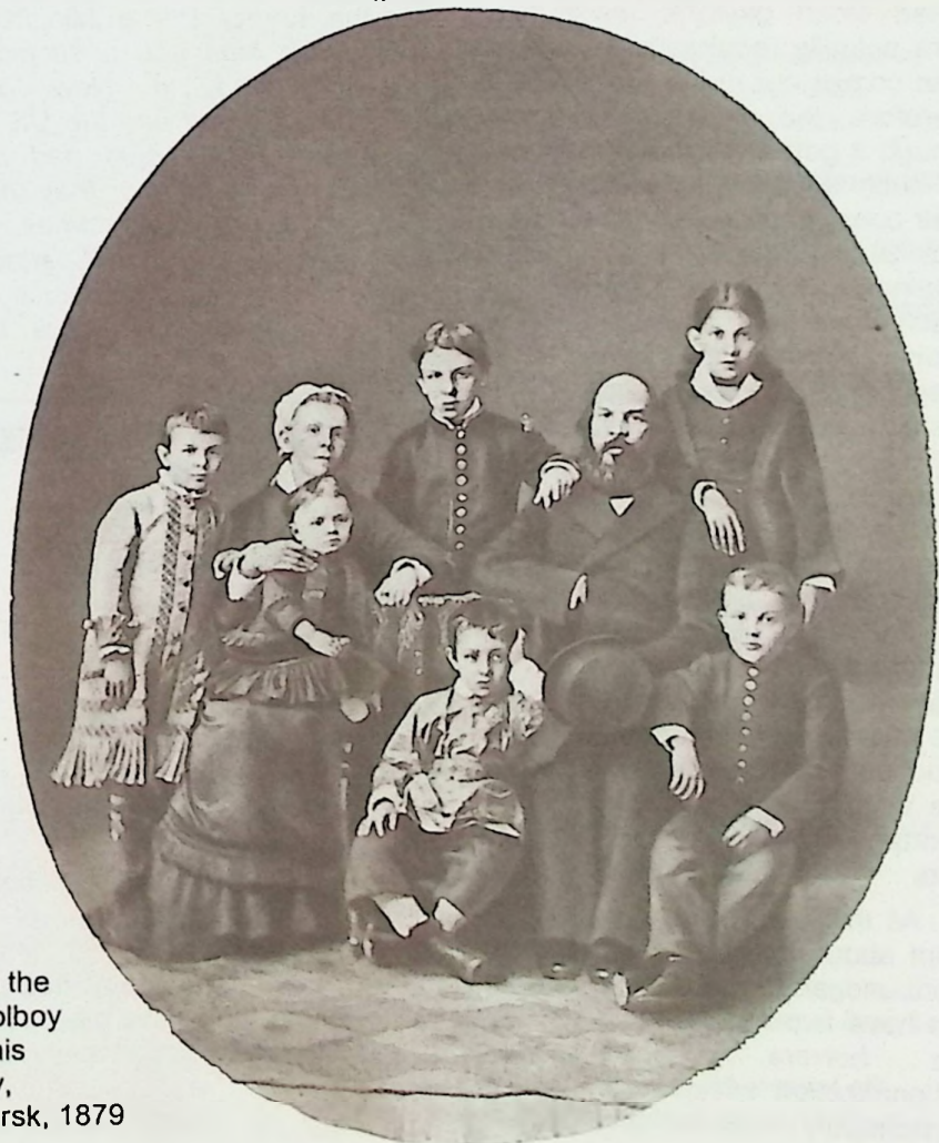
Lenin the schoolboy with his family, Simbirsk, 1879

The ability of the US to ignore its profligacy isn't unlimited, which we are now seeing with the so-called subprime mortgage crisis. I say so-called because this problem is now starting to spread to the credit card and auto loans markets and to the markets of much more complicated financial instruments. Many financial firms have now been laid waste and more are teetering or hurt despite massive state intervention to bail them out. There is a high probability that when all is said and done, we will have gone through a vicious recession. At the very least millions of workers are going to be ruined by the false bill of goods given to them even as the kings of finance are bound to turn this into a literal killing. Commentators have pointed to the following causes of this crisis: a housing bubble, easy money due to