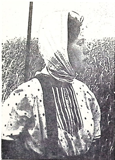
A collective farm woman guarding the harvest

Below: A factory woman blood donor has given blood for wounded Red Army man.