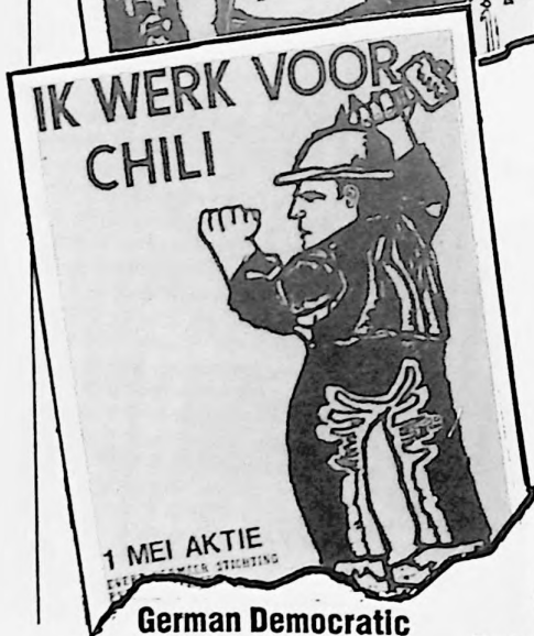
German Democratic Republic 1946