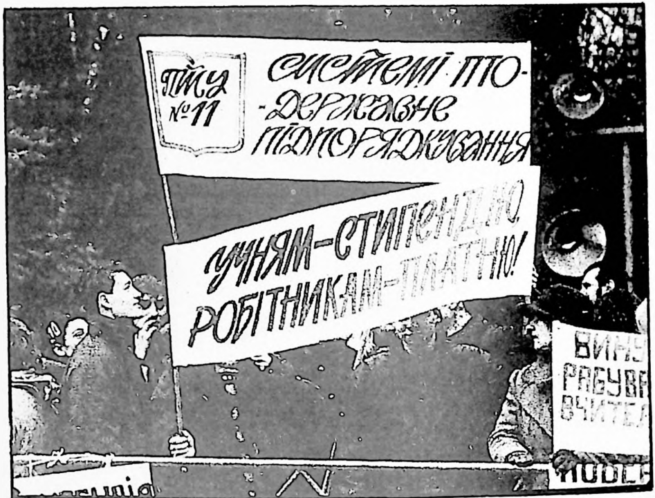
Teachers and students strike in Kiev, who went on strike against the present regime in Ukraine. One sign reads: "Stipends for Students and Pay for the Workers!"

"After the tragic consequences of the anti-socialist counter-