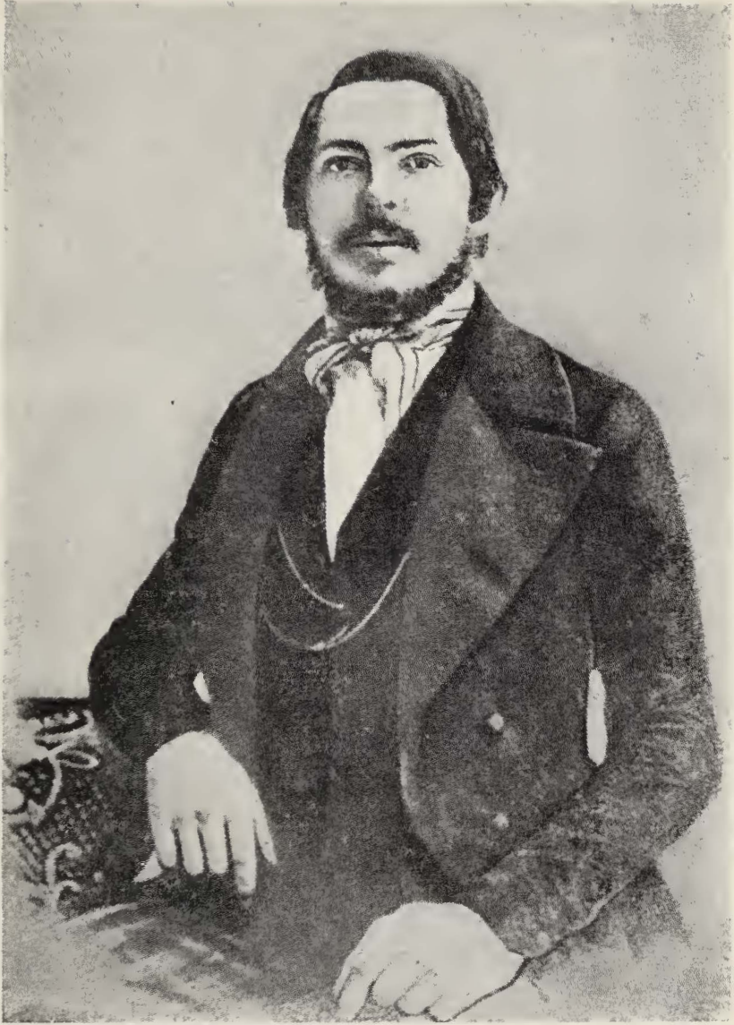
Friedrich Engels (1820-1895)