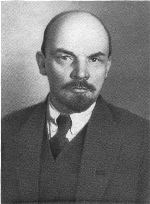
V. I. LENIN 1920