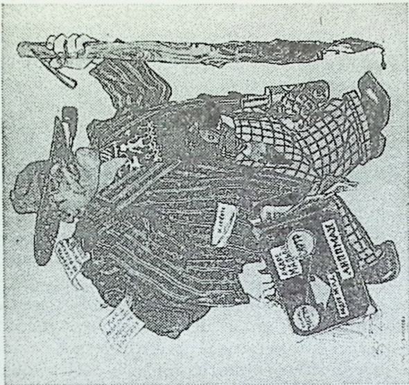
This reproduction is from the original as it appeared in the March 20 issue of Krokodil. The arrow clearly shows the name "Andre Zhid," which is the Russian transliteration for Andre Gide, French writer.