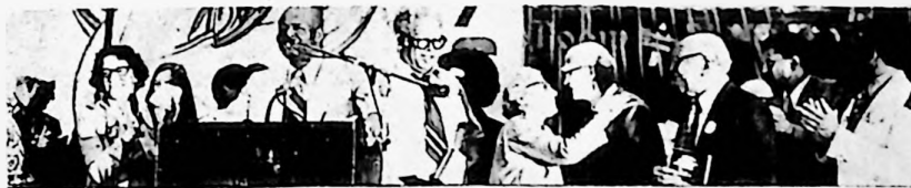
CHARTER-FOUNDING MEMBERS HONORED AT THE 21ST NATIONAL CONVENTION, CPUSA

It is common knowledge that our Party was the first to come to the defense of the Spanish Republic. This was one of the many instances when our internationalist solidarity was so clearly demonstrated.