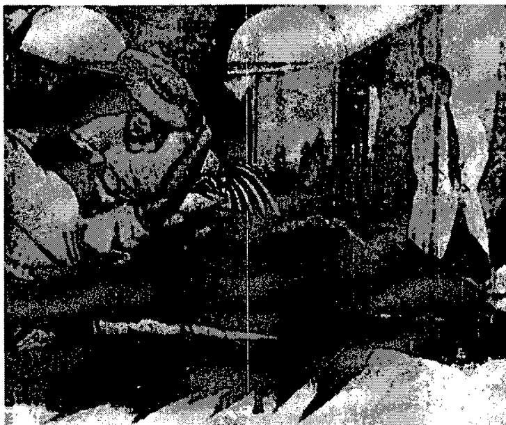
Netti returns to Leonid in the hospital on Earth at the end of Red Star

Leonid's ward, and I gestured to her to go behind the screen. I remained nearby at the bed of another seriously wounded patient I had to attend to in any case. I wanted to hear their conversation so that I could interfere if necessary.