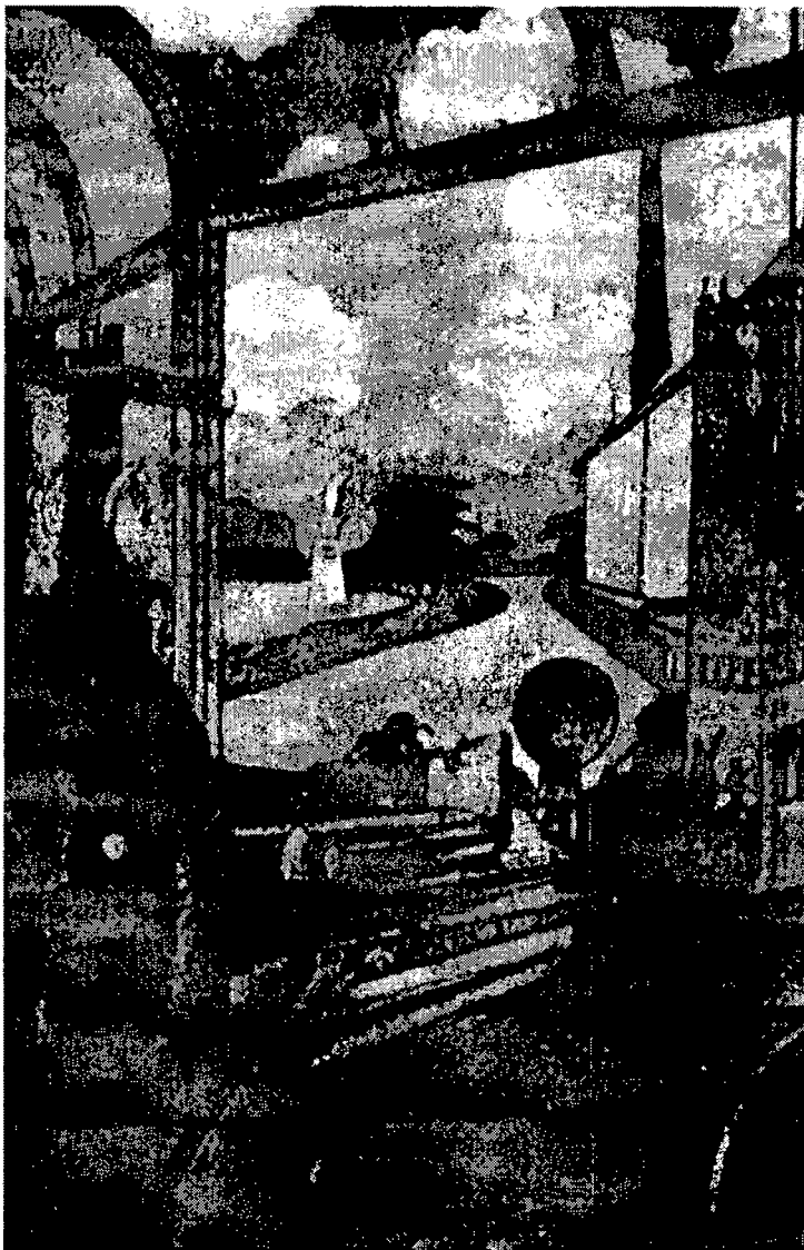
A Martian factory