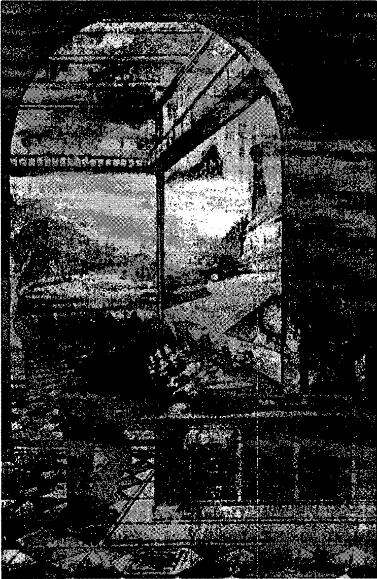
Leonid finds in the Martian library the stenogram of the debate about colonizing Earth