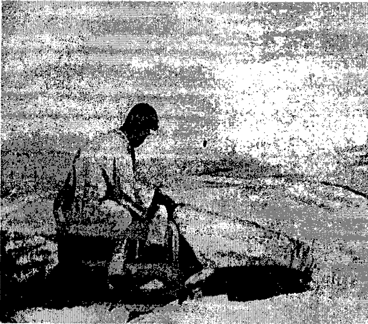
Leonid tries to recover from psychological disorientation outside the hospital on Earth after his return

merely giving me occasional sedatives. His main concern was for my comfort and tranquility. Each morning and evening he would drop in to see me after I had taken the bath prepared for me by my thoughtful comrades, but he limited himself to asking whether I was in need of anything. During the long months of my illness I had become quite unaccustomed to speaking, and would either answer him "no" or say nothing at all. I was touched by his solicitude, however, though at the same time I felt I was altogether undeserving of it and should tell him so. Finally I managed to summon enough strength to confess to him that I was a murderer and a traitor, and that all humanity was doomed to perish because of me. He smiled but said nothing, and after this occasion his visits became more frequent.