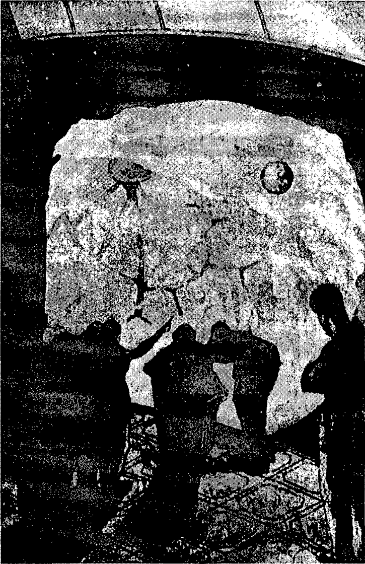
The approach of the space ship to Mars, with Leonid on board