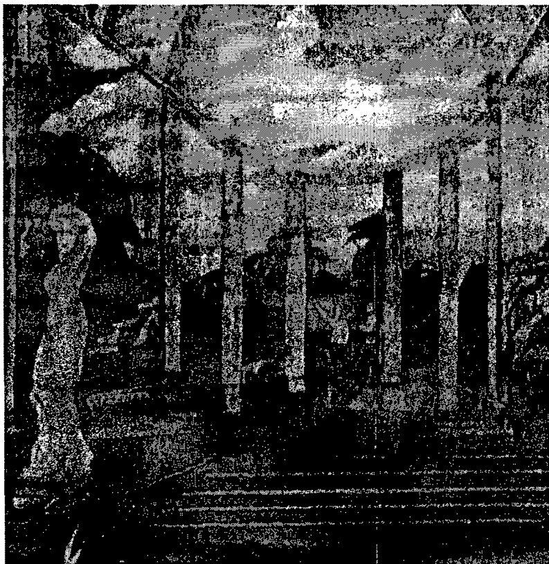
The room for the dying