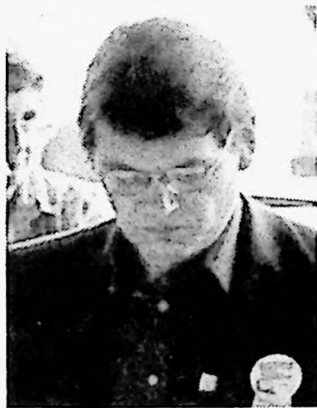
HANNES STUETZ, member, Central Committee, brought the greetings of the German Communist Party (Federal Republic of Germany)