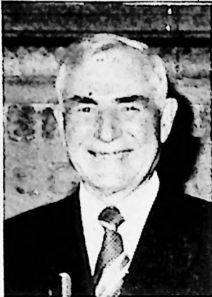
PETR FEDOSEYEV greeted the convention on behalf of the Communist Party of the Soviet Union.