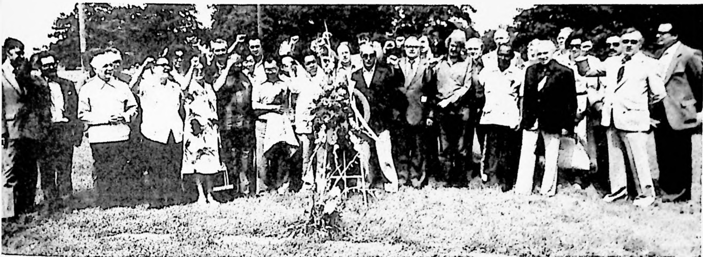
International delegates honor the memory of workers slain during the Ford Hunger March 1932. At the gravesite.