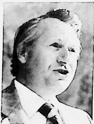
MANFRED FEIST, head of the Department on Foreign Information, brought the message of the Socialist Unity Party of the German Democratic Republic