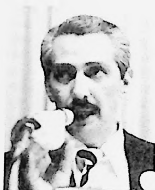
JORGE ENRIQUE MENDOZA spoke on behalf of the Communist Party of Cuba.