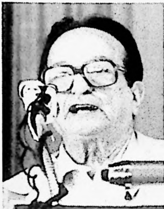
VALENTIN CAMPA SALAZAR spoke for the Communist Party of Mexico