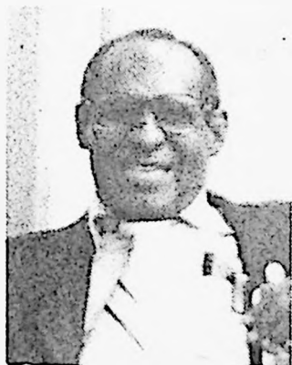
RAMON JULIAN PENA, Member of Political Committee of Central Committee, gave the greetings for the Dominican Communist Party.