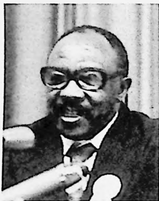
ALFRED NZO addressed the 22nd National Convention