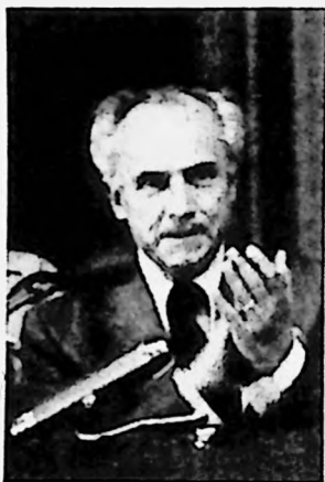
TOMAS TRAVNICEK, Member of Parliament, Professor Doctor, Acting President of the National Front, Member of Central Committee, presented the greetings of the Communist Party of Czechoslovakia.