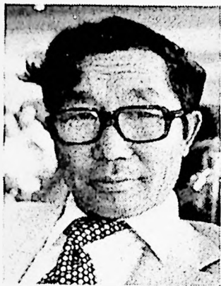
DAMDINY GOMBOZHAV, Alternate Member, Political Bureau brought the message of greetings from the Mongolian People's Revolutionary Party.