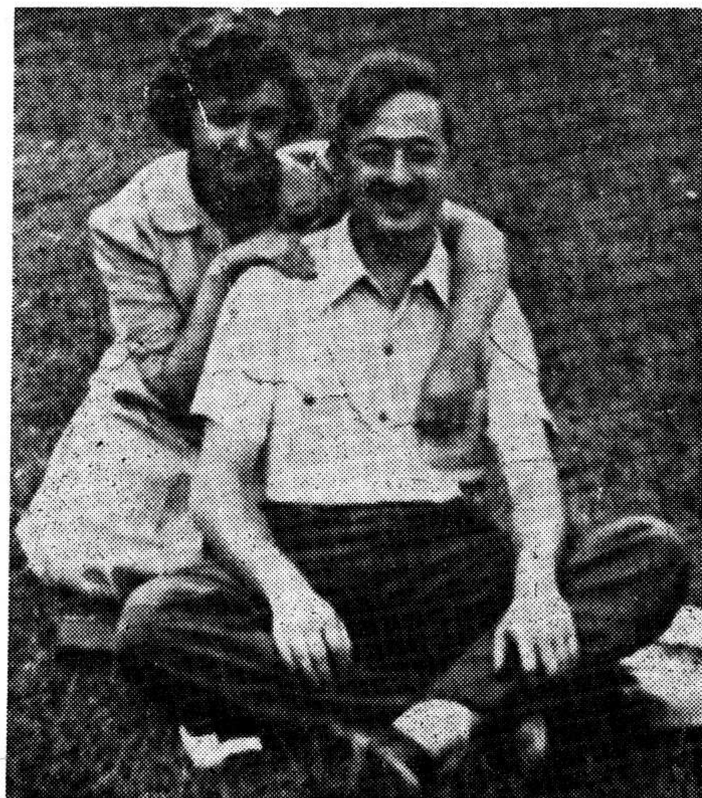
Ethel and Julius Rosenberg in their young love (1942).