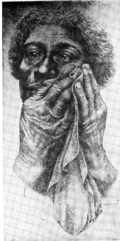
THE MOTHER By Charles White

(Note: The National Committee to Secure Justice in the Rosenberg Case asks all Americans to urge Attorney General Brownell to remove Sobell from Alcatraz and agree to grant him a new trial. )