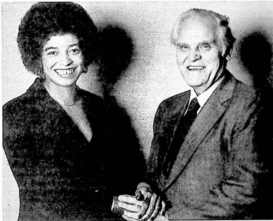
Angela Davis for Vice President